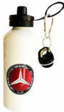
Aluminium water bottle £15.00