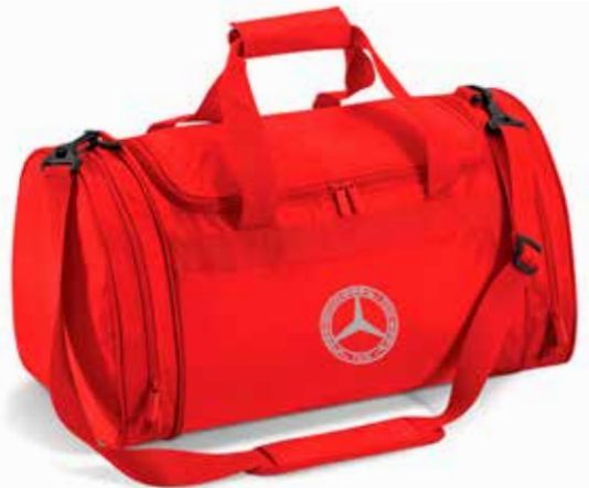
Holdall in various colours £25.00