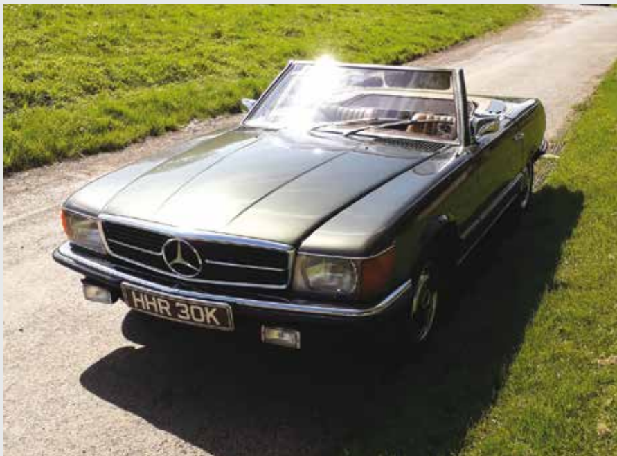
The car's hood is always down in the summer.

I bought the 350SL in April 2000 following a boring train journey from Cambridge to Manchester, with only a classic car magazine for entertainment. The transaction was done on the phone – the