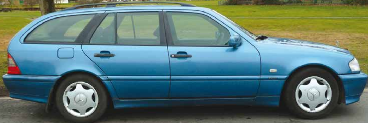
Chris Bass's 1998 C200 – looking as good as new after 200,000 miles.