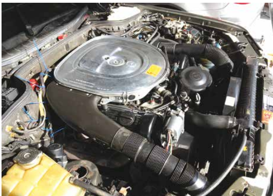
5.6-litre V8 engine.

The journey home was good and without any issues, the engine pulled like