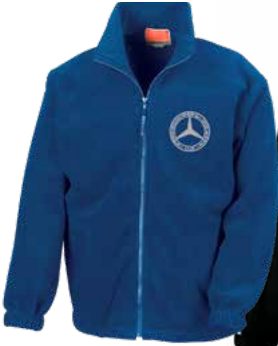
Club fleece in various colours £32.00

Available via the Club website or directly on www.mercedes-benz-clubshop.co.uk Post and packing is not included in the prices shown here.