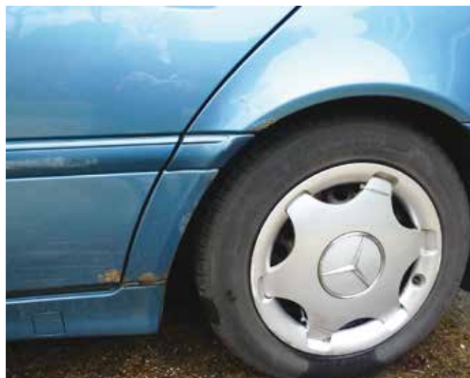
Rust at the corners of the doors and car park scrapes.