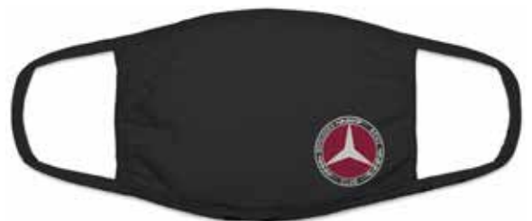
Club face mask £8.00