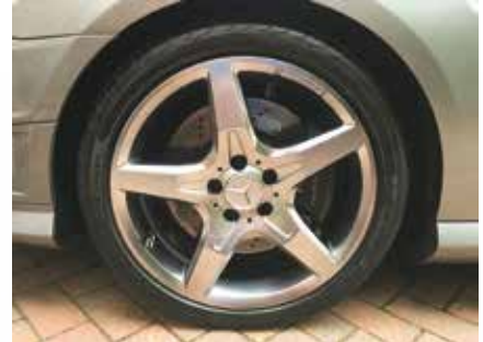
It has 18-inch AMG alloy wheels.

a range of issues and which was nearly out of its three-year manufacturer's warranty period, I felt it was time for a change. After a lot of searching and visits to see a few different SLKs, one appeared at a Volvo dealership just 10 minutes away from my home, a 2011 R172 SLK200 AMG Sport 125 Edition. Oddly it had been part-exchanged for a seven-seater XC90, from one extreme to the other. It was the right specification for me and had only done 16,000 miles in around seven years. I just had to buy her.