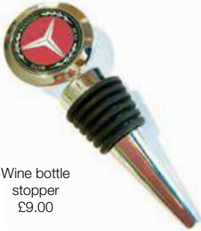
Wine bottle stopper £9.00