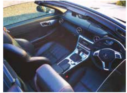
The R172 SLK's interior.

After owning a nearly new Corsa VXR that enjoyed regular trips to the dealer with