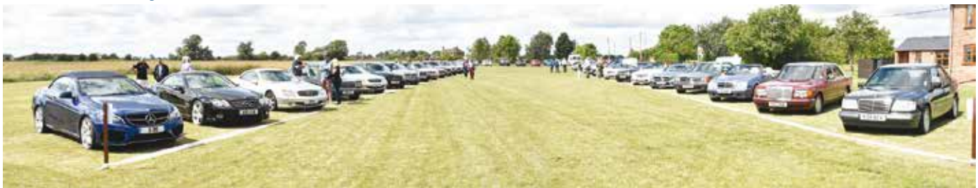
Sunny skies in Surfleet.

We have several events planned! Whereas in recent years we have enjoyed many events to the east and south of Cambridgeshire, we frequently have support from Members to the north and west and they particularly should find this year's activities of interest. This is how our schedule is currently shaping up (for further details of a particular event please e-mail the contact shown in brackets at graham.black@mercedes-benz-club.co.uk or viv.paul.brickett@mercedes-benz-club.co.uk ).