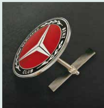
These badges come with provision for mounting on a grille.