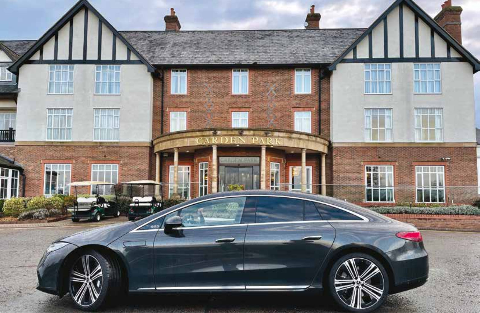
The EQS450+ Luxury at the Carden Park Hotel.