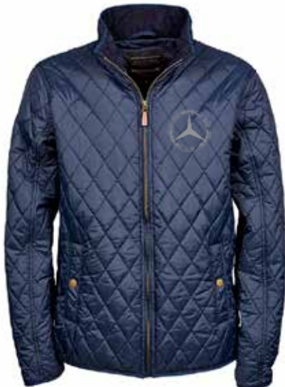
Tee Jay jacket in deep navy or hunter green £90.00