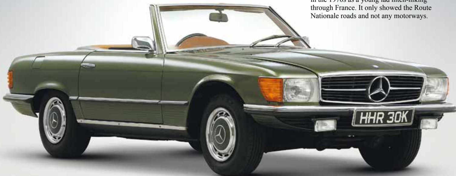
Jo Davies's 350SL at a studio photo shoot in 2016.