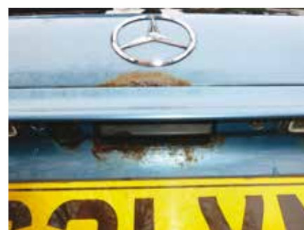
Rust on the tailgate...

Recently it started to use a little coolant and as I was also concerned about the effect of E10 petrol on its fuel system I