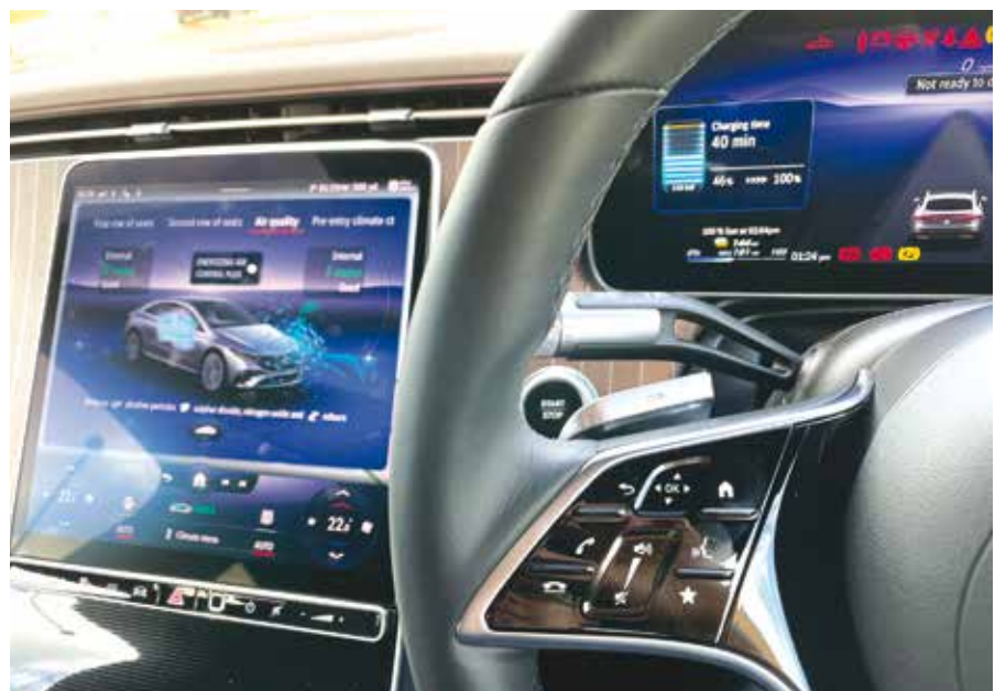
The EQS's dash with the 'single layer' screen on the left.

My plan was to make reference to the courage and determination of the first group of enthusiasts, setting up a club dedicated to Mercedes-Benz, just seven years after