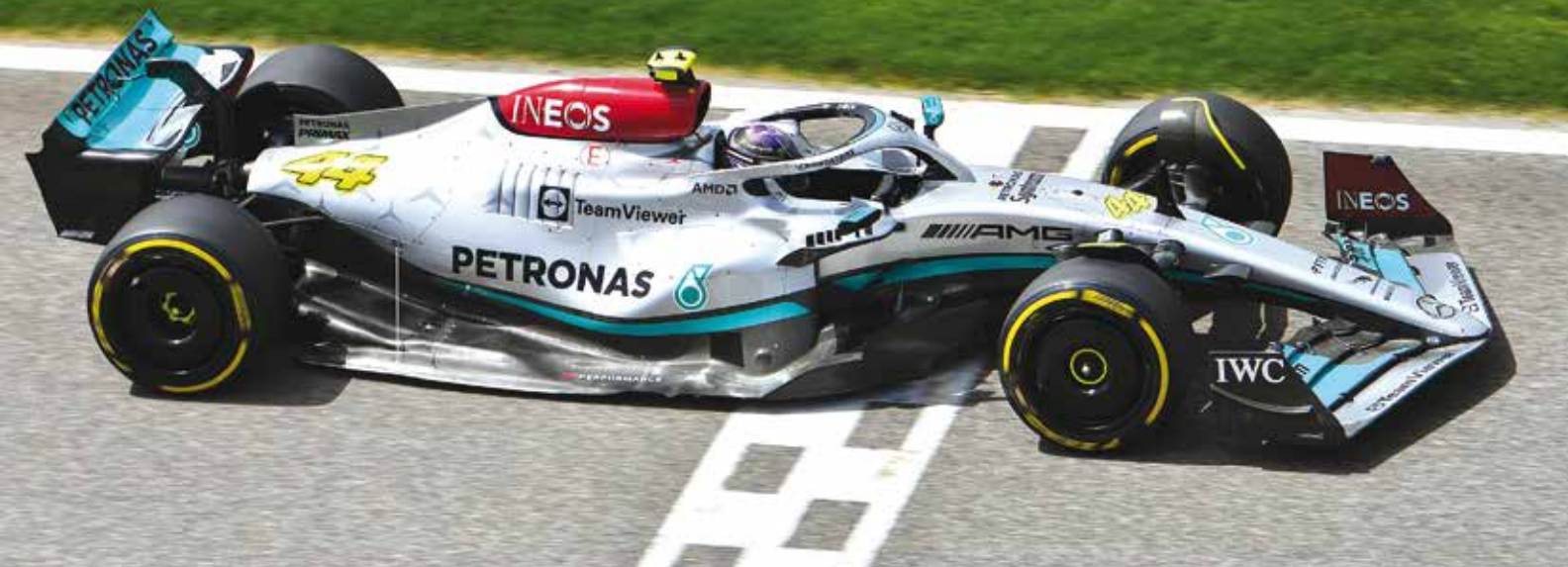
Lewis Hamilton testing the new car in Bahrain