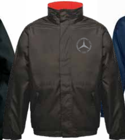
Red trim jacket in various colours £45.00