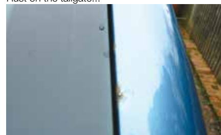
...and adjacent to it.