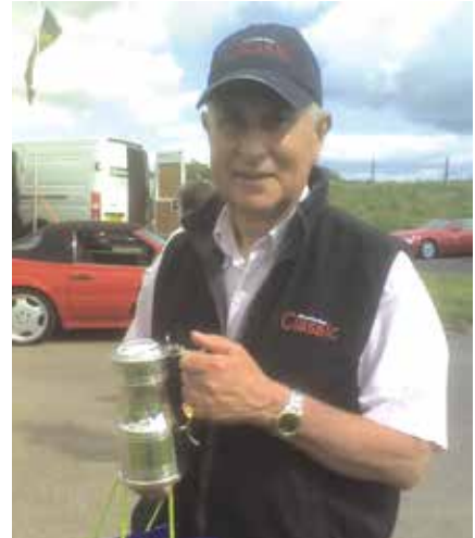
'A kind and considerate person'.