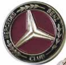
Pin Badge £8.00