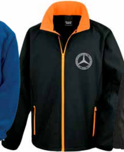
Softshell jacket in various colours £35.00