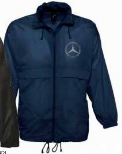
Unisex Windsurfer jacket in various colours £22.00