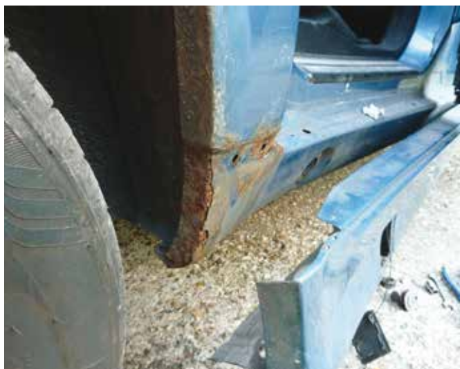
Rust under the sill covers.