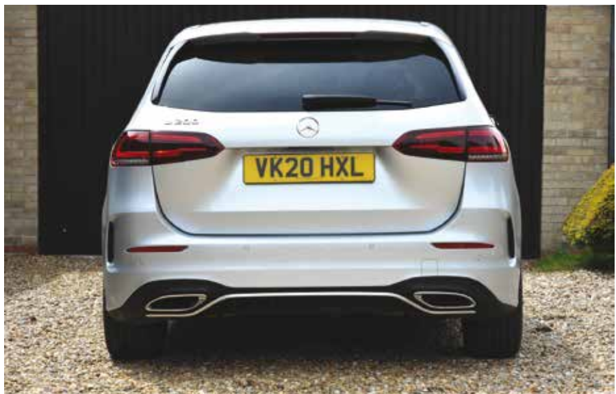
The reversing camera retracts above the number plate and the after-market tow-ball is removable.

This AMG Line model must contain an enormous number of semi-conductor chips to orchestrate all its electronic systems. I tried to discover how many, but the best I could establish from various internet sources is that complicated modern cars may contain up to 1,000 chips. If that is true, what will the service life be for these electronic beehives we are driving around? Will the casino slang 'sorry, you've had your chips' take on new meaning?