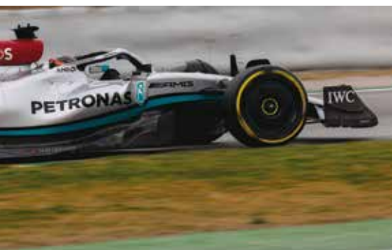
One of the most noticeable changes are the bigger wheels. This is George Russell's car in Barcelona.

As we went to press, the second test, in Bahrain, had just ended with the teams taking time to digest the results in the desert Gulf kingdom – the season opening Bahrain GP would be taking place just a week later. Red Bull certainly brought pace to the track, showing undeniable speed as well as a striking new side pod design. Mercedes' reliability continued, but its cars were off the pace as they dealt with porpoising, leaving Russell reckoning that the team had work to do ahead of the first race to catch both Red Bull and Ferrari. McLaren and Williams also had a challenging time. McLaren struggled to address front axle issues and needed new components to be flown out, whilst Williams was frustrated with a fire breaking out in Nicholas Latifi's car.