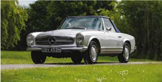
At the same sale this 1970 280SL went for £76,160...

Barons held its second sale at its new Southampton headquarters, which from a Mercedes-Benz point of view was not a success. Of the 12 cars in the catalogue only one managed to find a new home, a 1996 E220 cabriolet in dark blue with blue leather and 130,000 miles selling for £4,480.