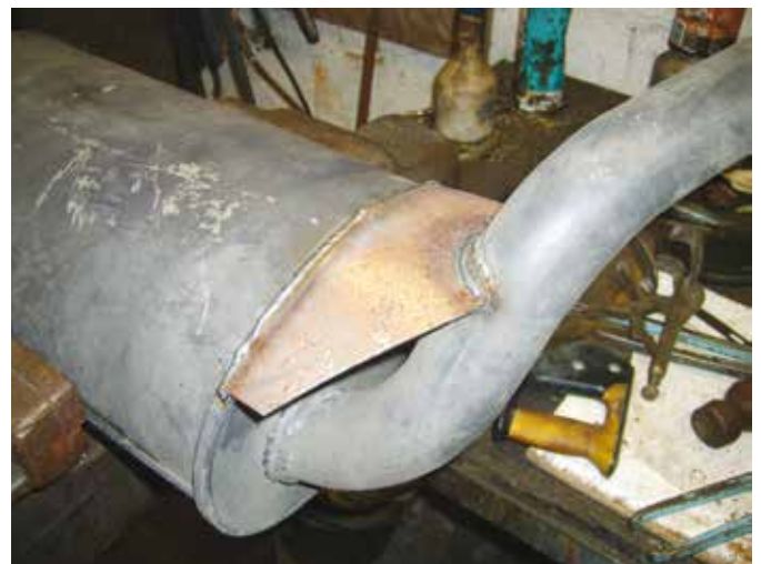
...and the finished modification. The silencer is upside down in these photos.