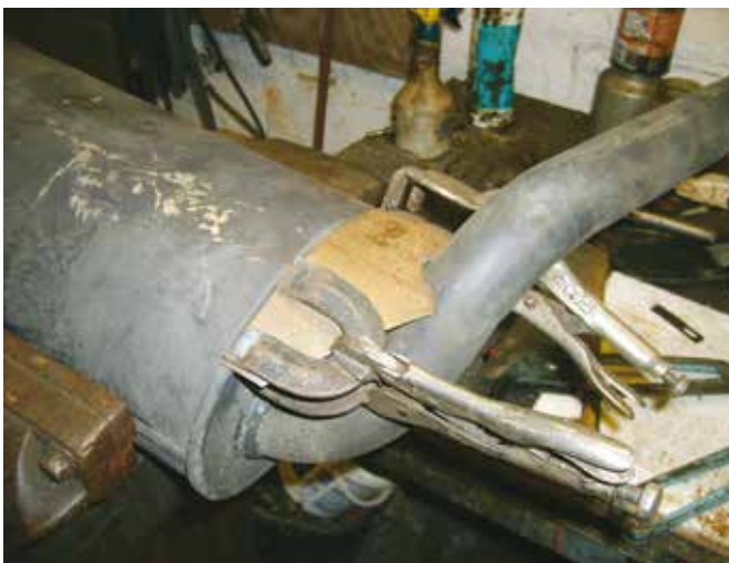
The strengthening web being fitted to a Mercedes-Benz replacement tail section in 2011...

It has long been the case that replacement exhausts, even from the manufacturer, are not made to the same quality as the components that are fitted when the car is new. The problem with the tail section on the W201 is that there seems to be a lot of stress on the joint where the pipe goes into the silencer. To overcome this I got a friend to weld on a strengthening web between the pipe and the silencer on the last tail section I fitted – this made it last 11 years rather than two. But finally the end plate of the silencer rusted