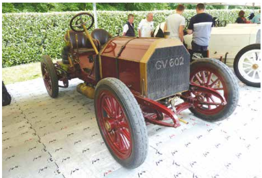
1903 Mercedes 60hp.

The 1903 60hp Mercedes that was featured in the June 2021 Gazette, a 1908 Mercedes Grand Prix car and a 1909 'Blitzen' Benz were running in the Pioneers class. '704', the 1955 300SLR driven by