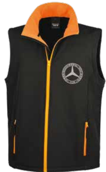
Softshell gilet in a choice of colours £32.00