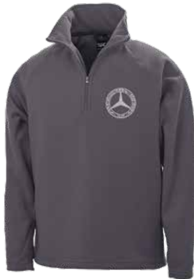
Micro-fibre fleece in a choice of colours £24.99