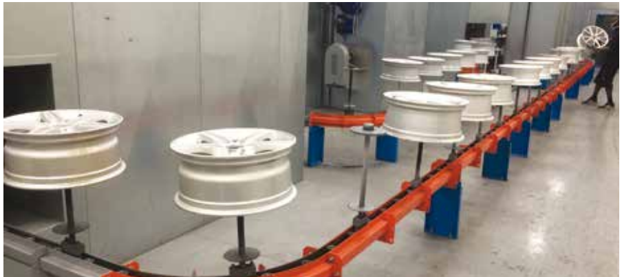
Supreme Wheels re-engineer up to 10,000 wheels a week.

We are limited to 30 people but still have a few places available for our visit to Supreme Wheels' vast new facility, located a stone's throw from the Mercedes-Benz UK headquarters in Milton Keynes. Come along and discover not only the scale of their operation (with capability for re-engineering 10,000 wheels per week!) but the complex technicalities of the work undertaken on different kinds of alloy wheels. We are also looking into an afternoon visit to another place of interest nearby. The deadline for booking a place is August 29 and if you would like to hear more about our visit please contact me ( graham.black@mercedes-benz-club.co.uk ).