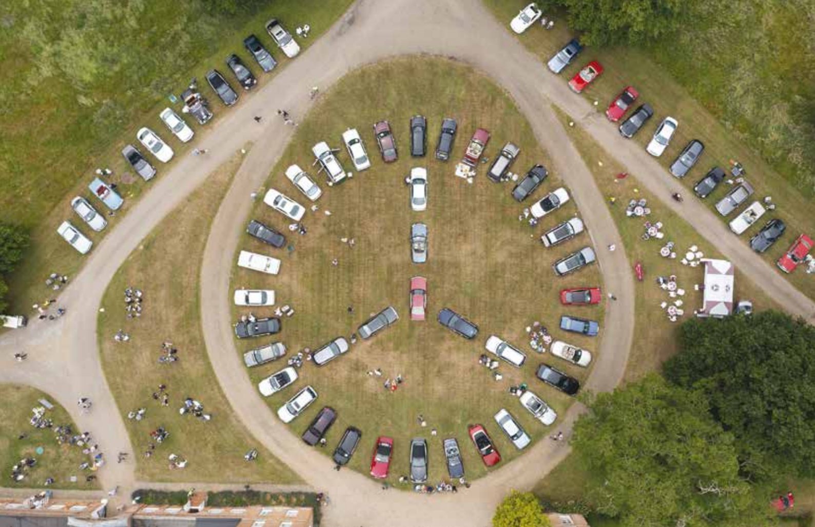
The cars were the star.