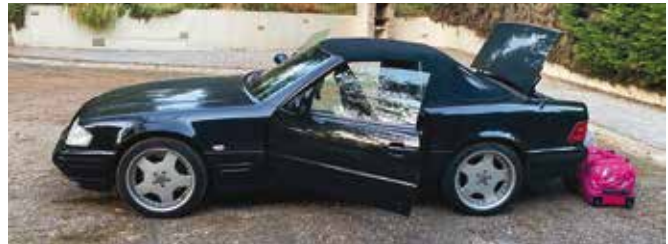
Ready to go.

In complete contrast to the technical side of things, we have a section where Members can tell us what they have been up to with their Mercedes-Benz. This is a typical item.