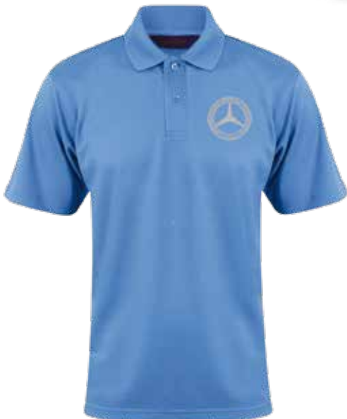
Coolplus polo shirt in a choice of colours £32.00