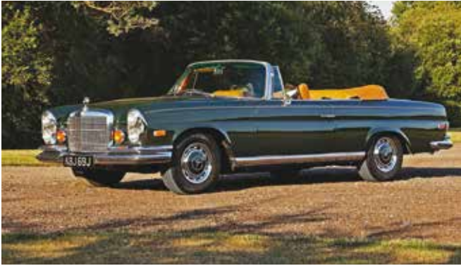
Historics sold this 1971 280SE 3.5 cabriolet for £156,800.