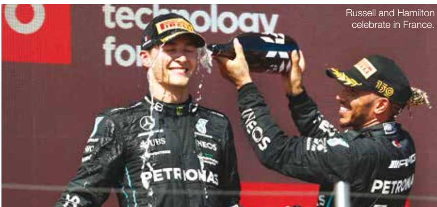
Russell and Hamilton celebrate in France.

F1's teams appear to have achieved a consensus to help eliminate the problem of cars bouncing rhythmically, known as 'porpoising', at speed. Reports suggest that agreement has been reached to change the rules to mandate the raising of the floor by 15mm (0.6 inches). Mercedes has suffered most of the front-running teams and has been vocal in driving through the change, citing the potential health impact on drivers being subjected to the constant bouncing motion, with the FIA commissioning a medical report into the issue. Red Bull and Ferrari had accused Mercedes of only pursuing the matter as it couldn't resolve its own problem and, with this in mind, the FIA was considering a vote on the matter – and suggesting a 25mm (one-inch) height increase, but the current compromise seems to allay health fears whilst allowing an agreement to be reached.