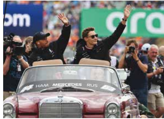
Hamilton and Russell being introduced to the crowd in suitable transport in Hungary.

The summer break kicked off with some dramatic news as former champion Fernando Alonso announced he'd be leaving Alpine and driving for Aston Martin in 2023 alongside Stroll, taking retiring Sebastian Vettel's seat and leaving an unexpected vacancy. Alpine was apparently unaware of the situation before Alonso made the announcement, though denied that the apparent breach of