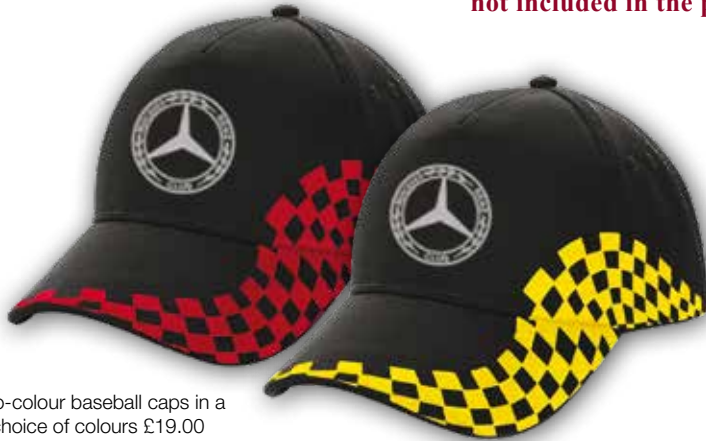
Two-colour baseball caps in a choice of colours £19.00

Available via the Club website or directly on www.mercedes-benz-clubshop.co.uk Post and packing is not included in the prices shown here.