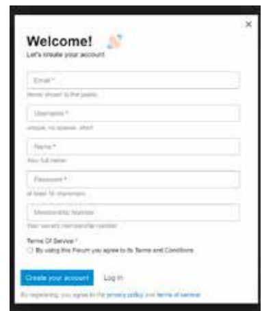
The Forum log-in page.

To access the Forum go to the website https://forum.mercedes-benz-club.co.uk/login Click 'Sign up'. The e-mail address you give must be the same one as you use for the Club's main website. If you have problems with this contact Catherine Barlow ( catherine.barlow@mercedes-benz-club.co.uk ). We suggest you choose a 'user name' which includes at least part of your real name if not your full name. Click 'Create your account' The moderators will add you shortly.