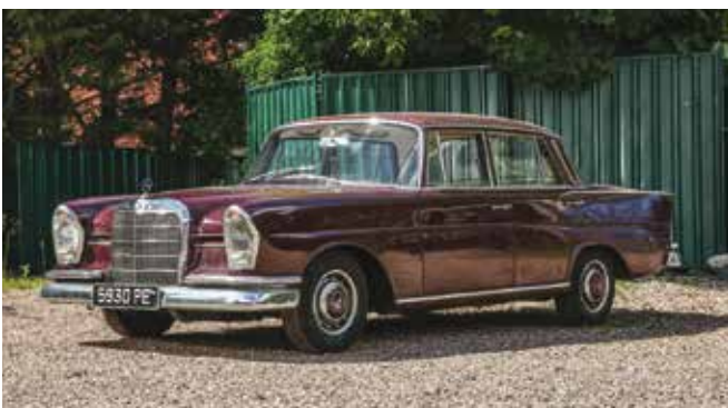
...this 1963 220SEb Fintail was sold for £27,734...