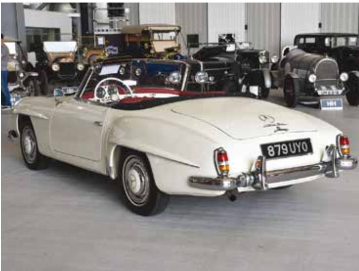
Said to have received a ‘bare metal restoration’, this left-hand-drive 1960 190SL was sold in Switzerland, then into Wisconsin and finally to the UK in 1994 (not sold).