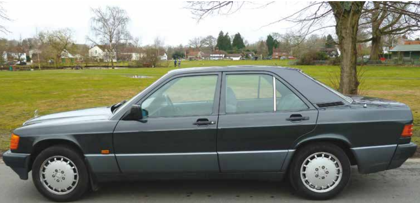
Chris Bass's 1991 W201 190E 2.0.