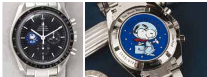
The Omega Snoopy Seamaster's face...