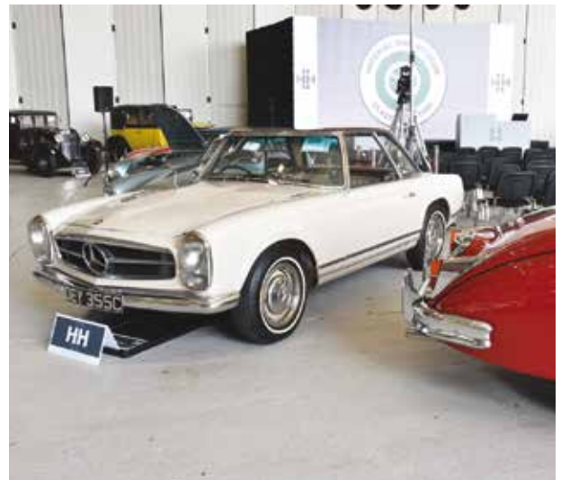
Vying for attention with an adjacent Jaguar XK150, despite its 15,000 mileage this Pagoda 230SL had some bubbling starting below its 1990s respray (not sold).