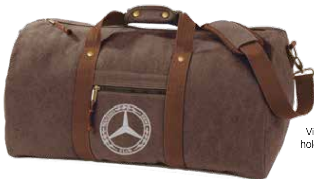
Vintage canvas holdall in a choice of colours £39.95