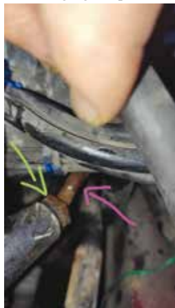
The offending nut and pipe.

This was the point that the Member posted on our Forum and asked for ideas from anyone who might have been in this predicament before. Over the next few days plenty of helpful suggestions arrived and the outcome of this adventure was the successful separation of the nut