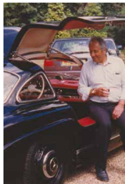
...admiring the fruits of his labours.