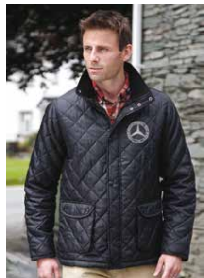
Urban quilted jacket in navy blue or black £64.00