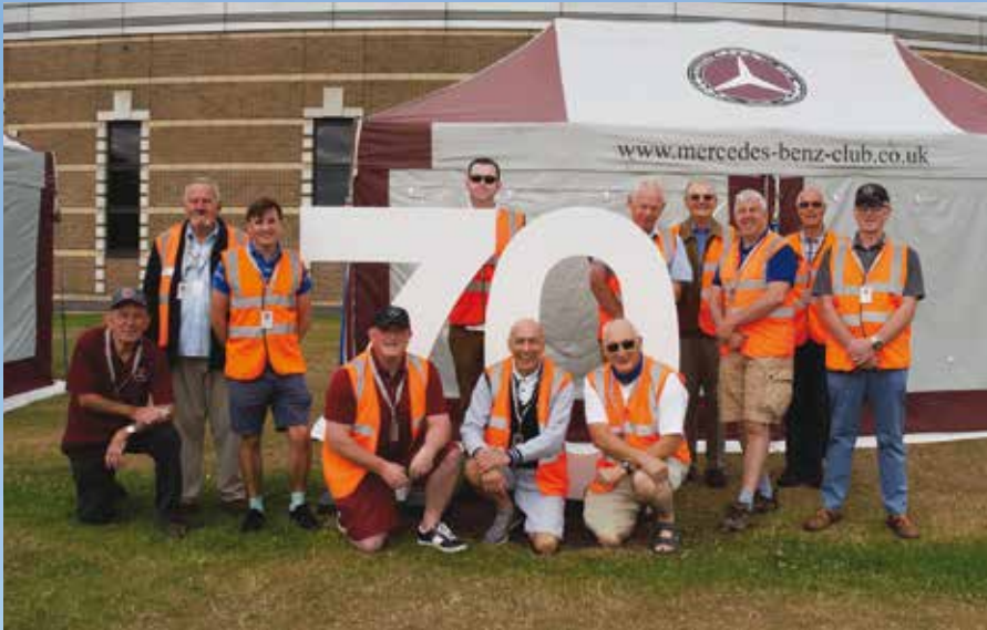
Concours Judges ready to start work.