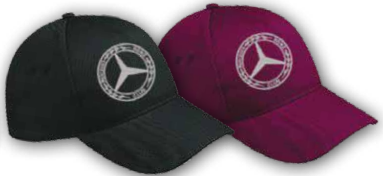
Single colour caps in a choice of colours £17.99