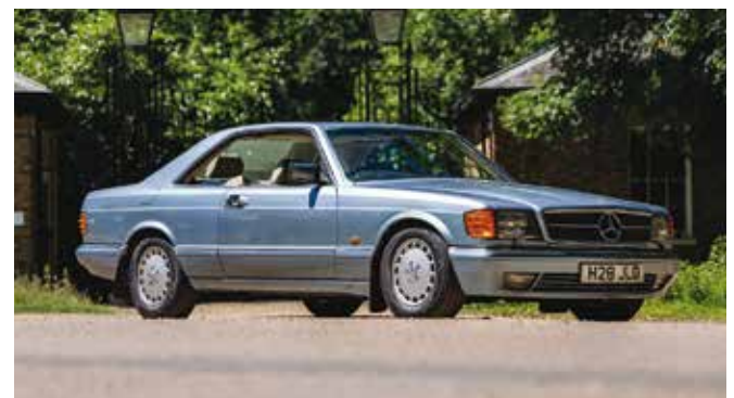
...and this 1990 560SEC made £26,880.

SWVA (South West Vehicle Auctions) was also on-line only and sold all of its 10 Mercedes, the best of which was a 1998 SL500 in Designo red with grey trim (one of only 150 right-hand-drive versions) and 72,000 miles which sold well above estimate at £19,580.